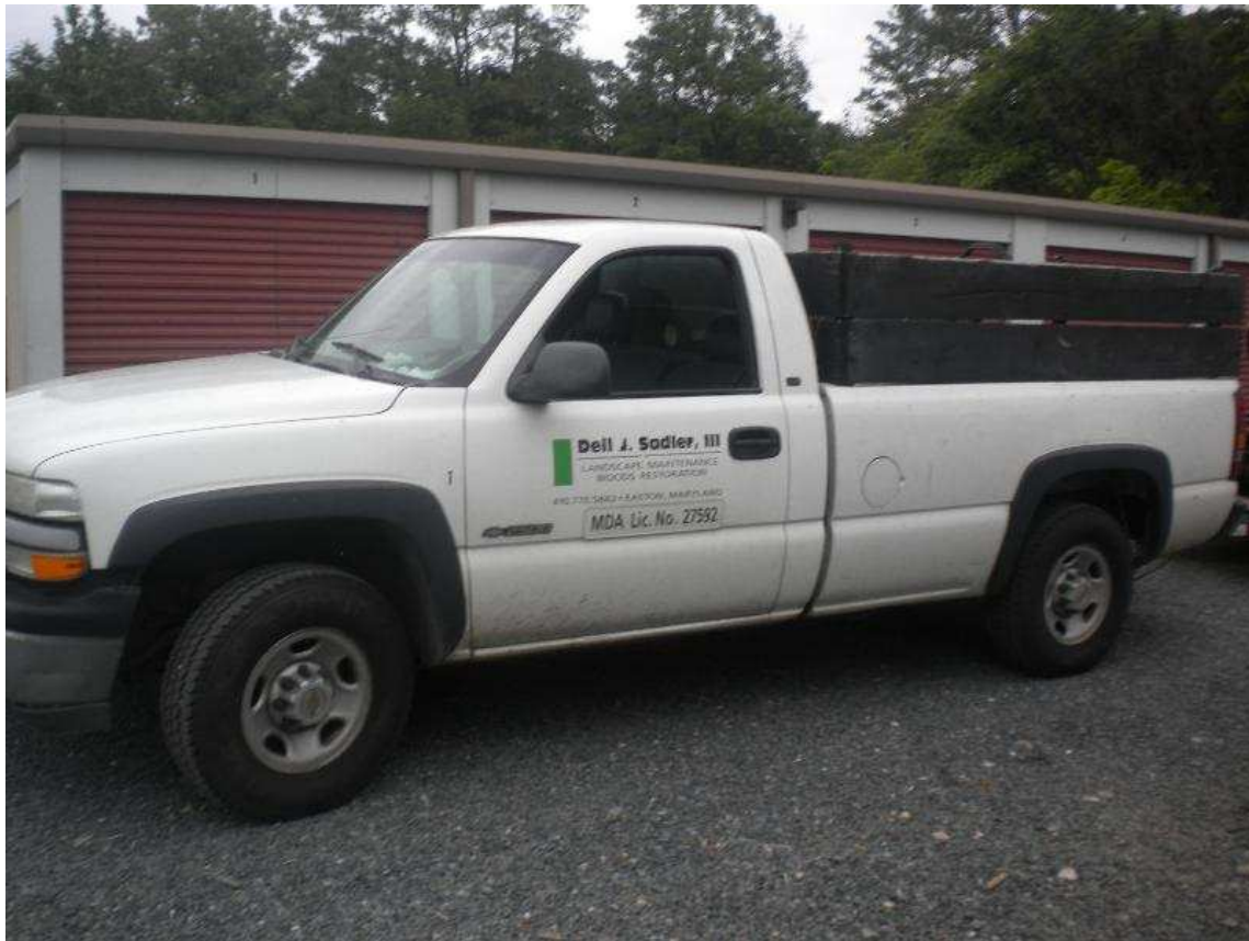
We still use this truck today!

Today, we have almost 20 employees. In addition to several of my family members, we have a husband/wife/brother team. We also have a father/daughter and father/son. When we say a family business, we really mean it.