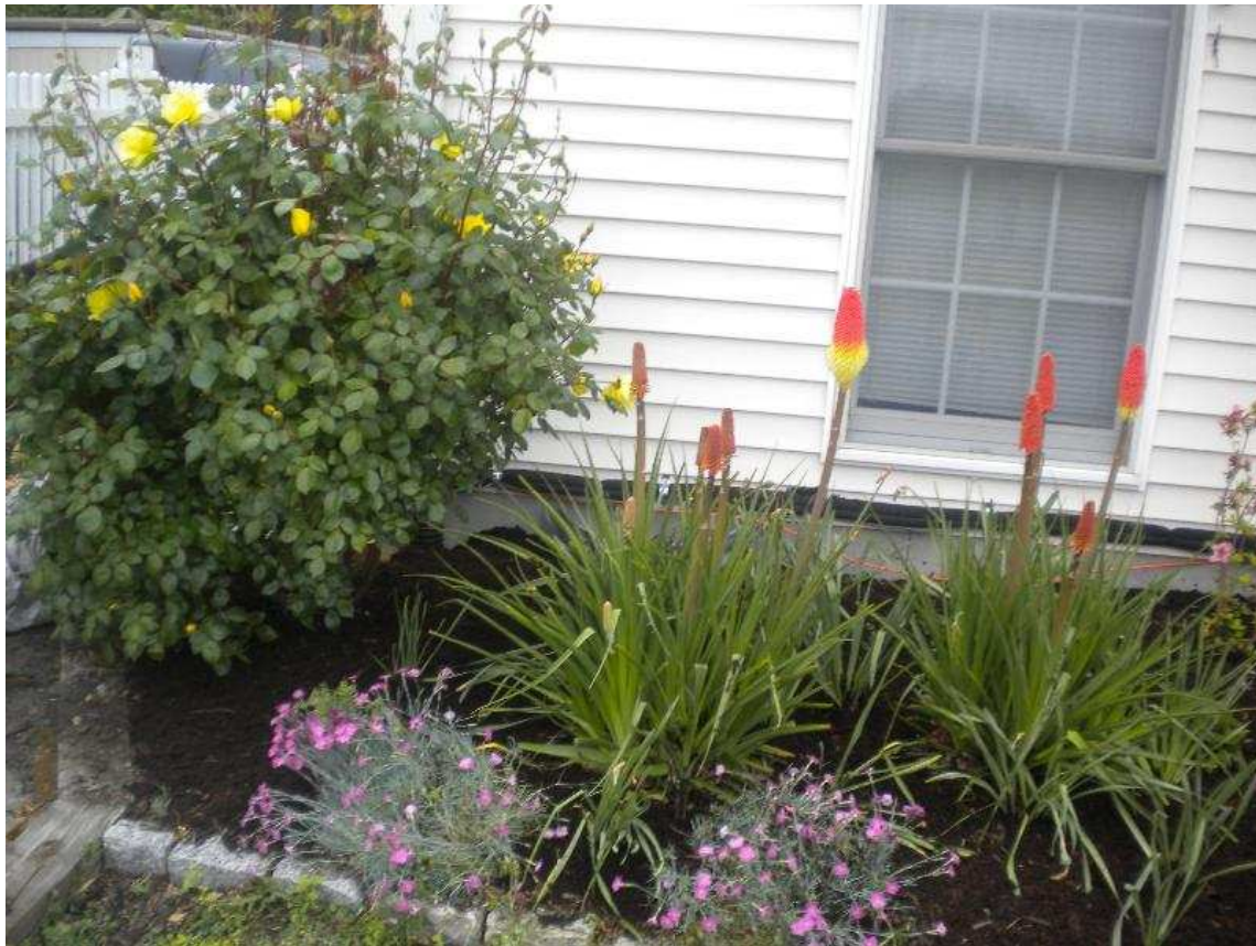
We call the orange and yellow flowers Red Hot Pokers. We don't know their real name.

There are archive issues of my newsletters on my website, dellsadler.com . They date back to 2007.