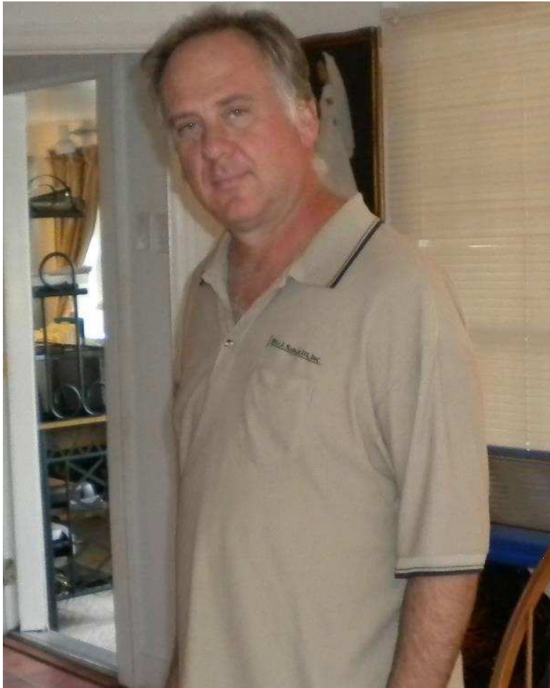
Here I am, in uniform, ready for a meeting.

We began offering landscaping services in December of 1997. It was one of the coldest winters I can remember. And, a ridiculous time to start a landscaping company.