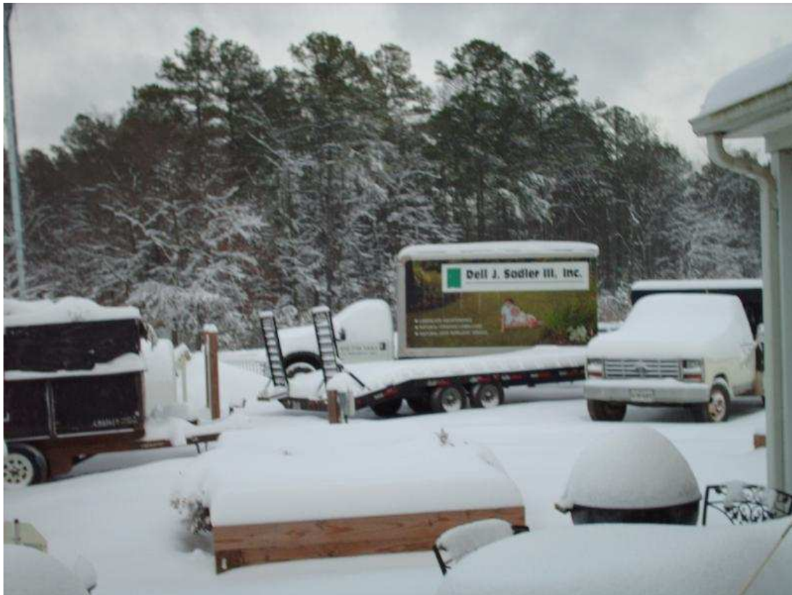
Obviously, we made mistakes along the way.

Our company was based in Easton, MD when we first began operations.